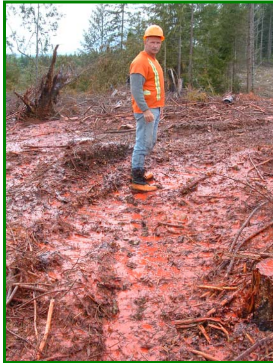
Figure 3. Typical coverage of Thermo-Gel in opening.

Samples at “ 210-mid ” were taken within five minutes of the drop. Figure 3 shows the coverage along the flight path 5m away from the stream channel. Figure 4 shows the dissipation of Thermo-Gel® that has occurred 5 minutes since the drop. This stream was flowing approximately 25L/min at the time of delivery.