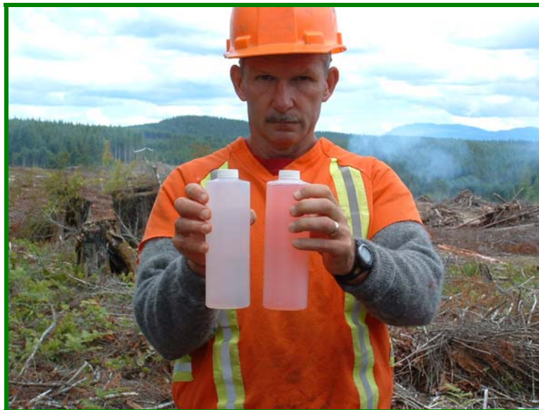
Figure 8. Contrast of subsurface and surface colouring.

Figure 8 visibly contrasts the effects of Thermo-Gel® on the surface on the right (more colour) with the subsurface samples on the left one hour after delivery. The water surface area of the swamp was about 200m 2 and there was no surface runoff in or out of the swamp during the trial. The swamp was 1-3m deep.