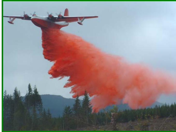
Figure 5. Hawaii Mars begins drop on sample sites.

Samples at the swamp were taken 1 hour after the initial drop. Figure 5 shows the Hawaii Mars as it began its drop on the swamp and creek.