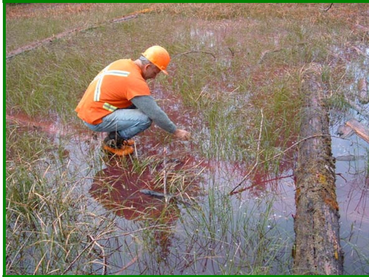
Figure 7. Close up view of colouring on swamp surface.

Figure 8 visibly contrasts the effects of Thermo-Gel® on the surface on the right (more colour) with the subsurface samples on the left one hour after delivery. The water surface area of the swamp was about 200m 2 and there was no surface runoff in or out of the swamp during the trial. The swamp was 1-3m deep.