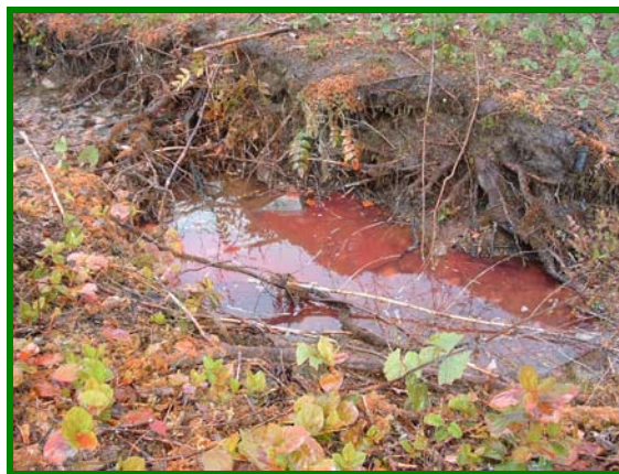
Figure 4. Dissipated Thermo-Gel residue 5 minutes after delivery at 210-mid.