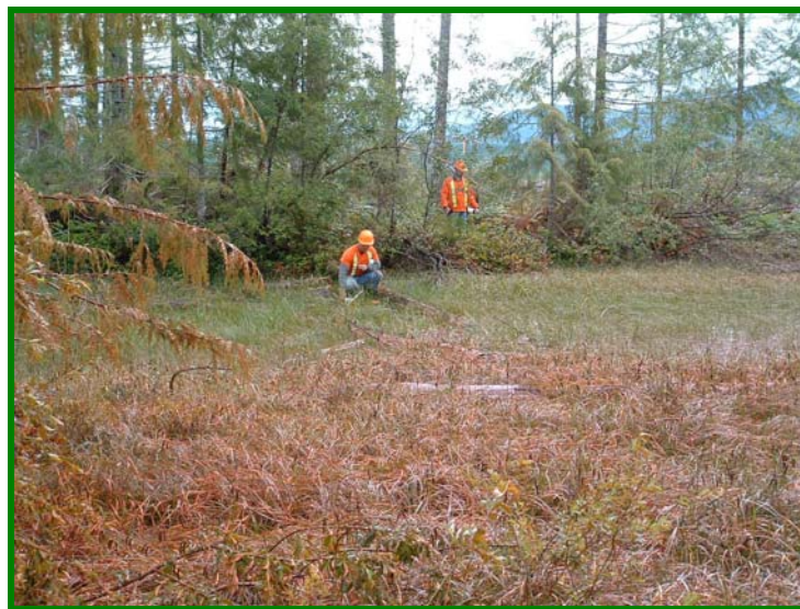
Figure 6. Wide view of colouring on swamp.

Figures 5 and 6 show the red food colouring dye of Thermo-Gel® visible on the swamp surface.